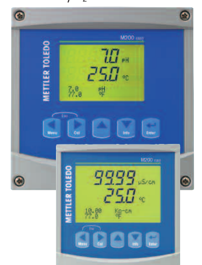
M200 easy 1/2 DIN

One transmitter, four measurement parameters: the versatile M200 easy minimizes your costs of ownership. Thanks to pre-calibrated digital sensors, minimal transmitter configuration is needed.