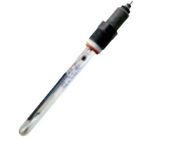
easySense pH 32, 33, 34