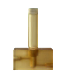
easyDip 21, 22